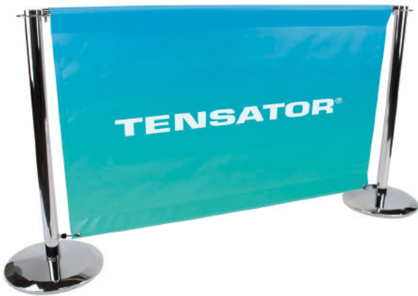
Tensator's Café Banners measure just under 1.5m from post centre to post centre (1330mm).